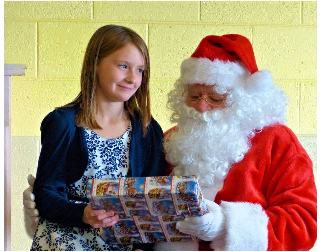
Time with Santa. Sorry I don't know the names of the children to be able to label the photos. All photos will be on the website in the photos section. www.wichaptermafca.com