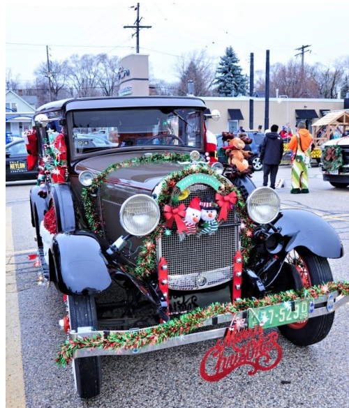
The Schmiechens arrived in festive fashion.