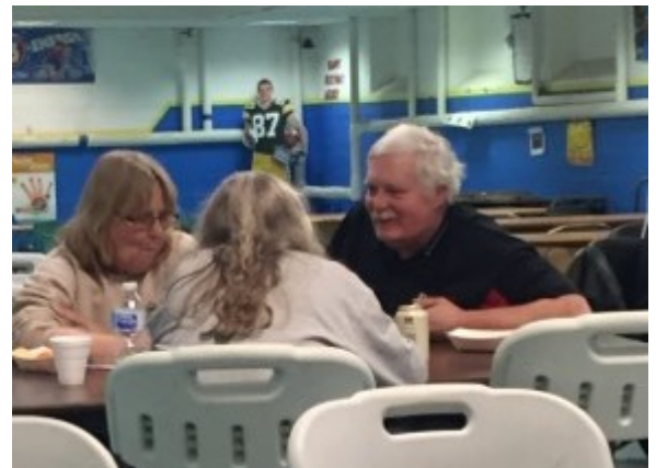
Teams hard at work...