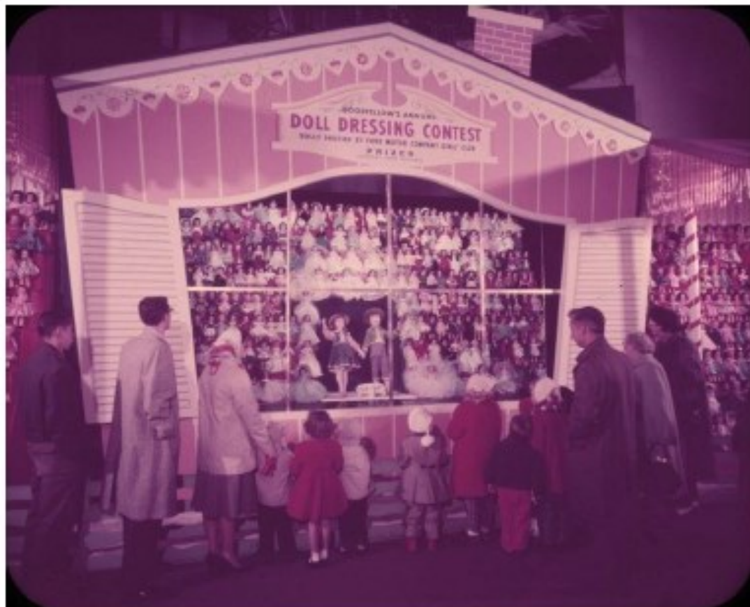
Visitors view dolls from the Ford Motor Company Girls Club