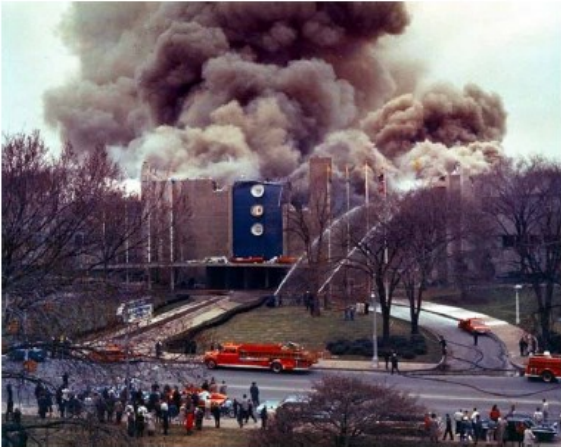
Ford Rotunda is destroyed by fire – November 9, 1962.

Imagine how much farther your food budget would stretch if your next shopping trip was based on yesterday's prices (1930's)