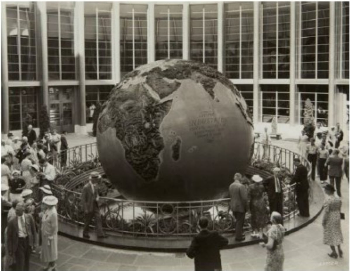
The Ford World exhibit...