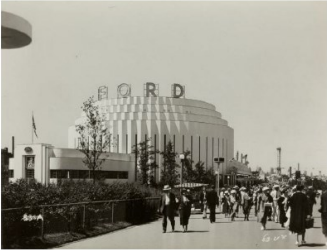
Visitors to Rotunda during the 1934 World Fair in Chicago...