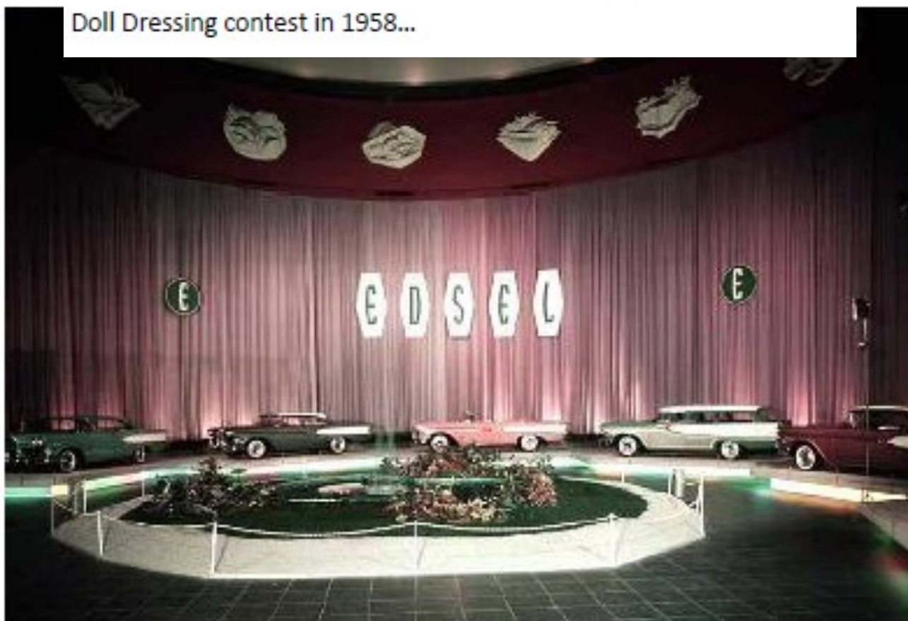
The 1958 Edsel introduction at the Rotunda...