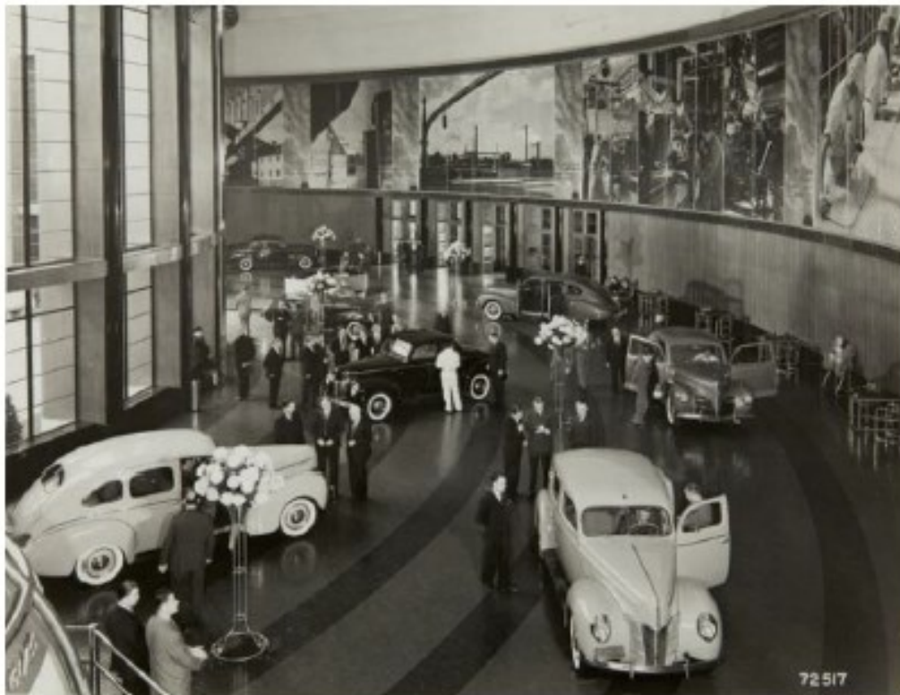
Ford Models for 1940 displayed in Ford Rotunda in 1939...