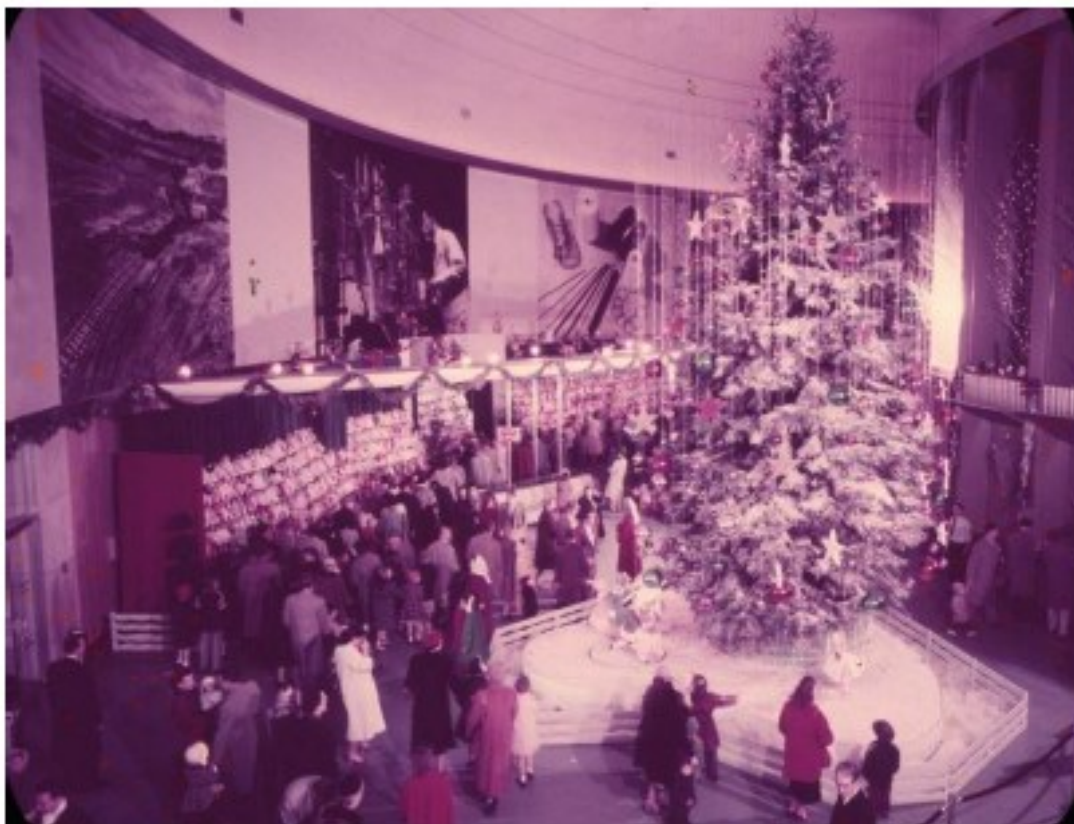
The Christmas tree and doll display at the 1955 Christmas Fantasy...