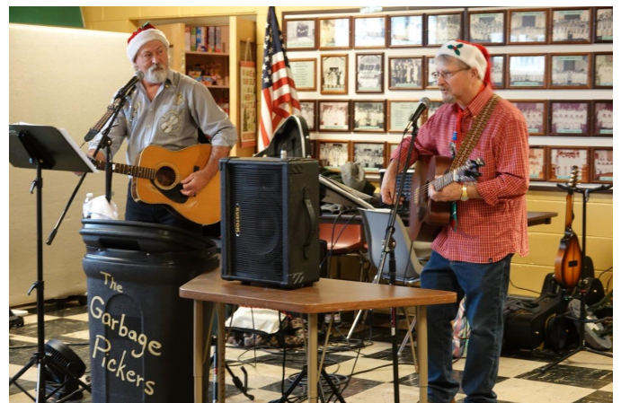
The Garbage Pickers music group