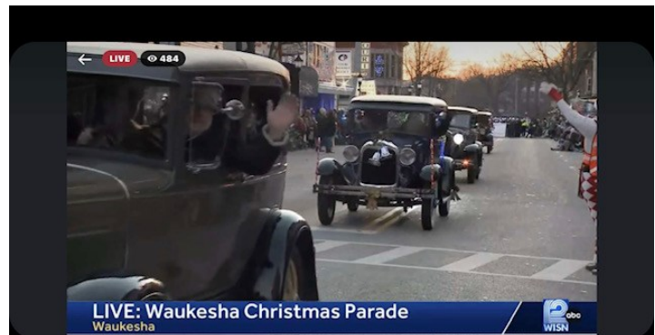
WTMJ4 Parade is at https://www.youtube.com/watch?v=cO4G7_rPoqY the club comes in at 18.:49 on the counter