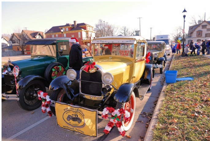
Time to decorate!