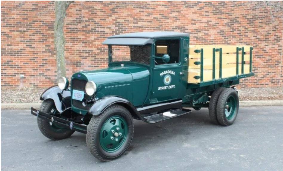
1930 Ford AA Dually

The popular Ford AA Dually, like the Model A, was built from December 1927 thru December 1932. The big trucks used the same 40 hp four cylinder engine as the cars and shared many of the same parts. The chassis was a sturdier 131.5 inches, upgraded to a 157 inch wheelbase in 1930. The transmission consisted of either a three speed manual or a four speed that used a “granny” first gear.