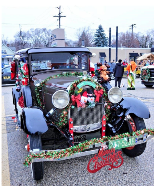
The Schmiechens arrived in festive fashion.