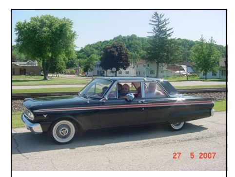
The Smith's in their "modern car"