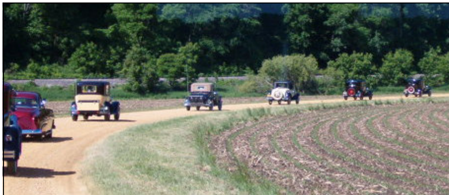
Gravel road from the ferry landing to the main road.