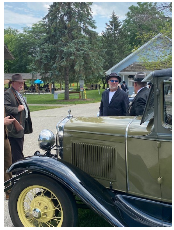
Planning the raid on the still