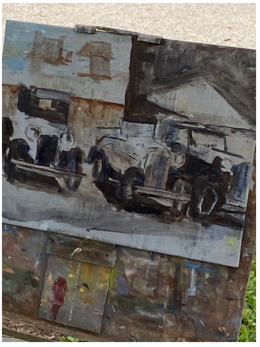
Local artist was painting the Model A's, never got to see the final painting.