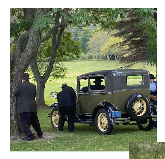
More photos online at Www.wichaptermafca.com under photos.