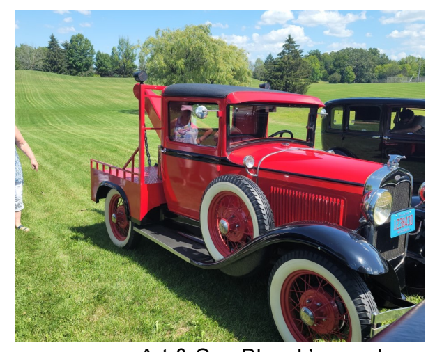
Art & Sue Blazek's wrecker